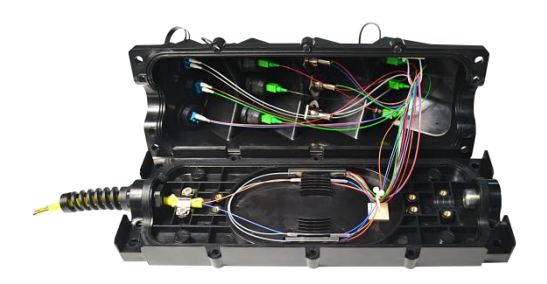
FTTX Enclosure with PLC Connection Project